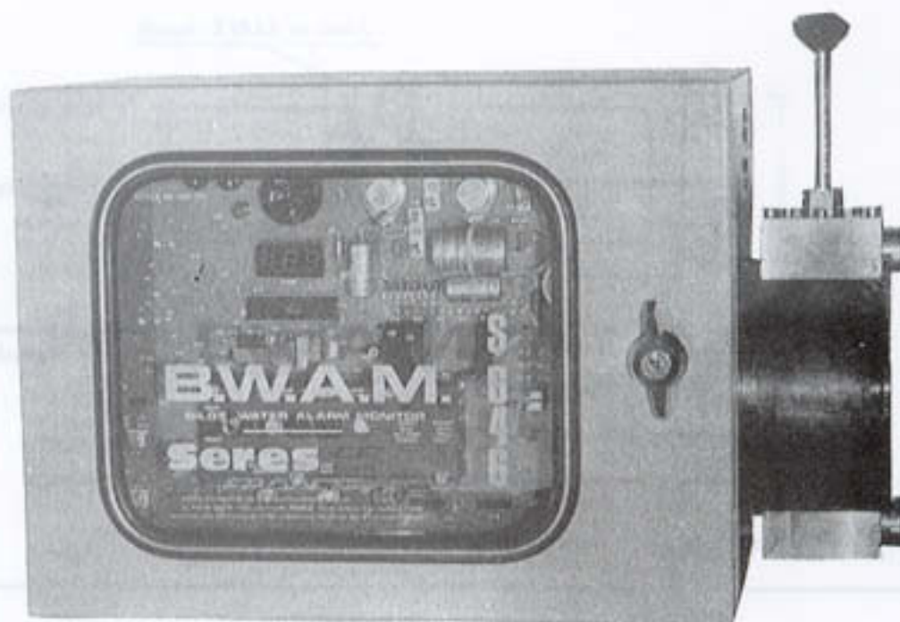
BWAM S. 646 Weight : 12 kg Dimensions : 300 x 400 x 230